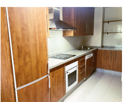
Ref.-ID: R5001379 Elviria