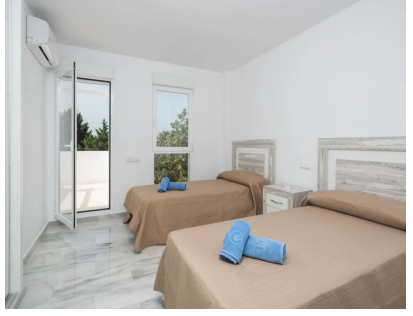
Community: 2,280 EUR / year