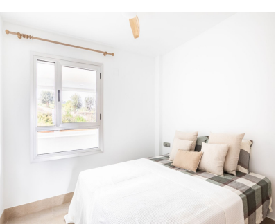
La Cala Golf Ref.-ID: R4991035