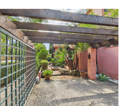
Ref.-ID: R4986919 Estepona

Community: 264 EUR / year IBI: 1,250 EUR / year