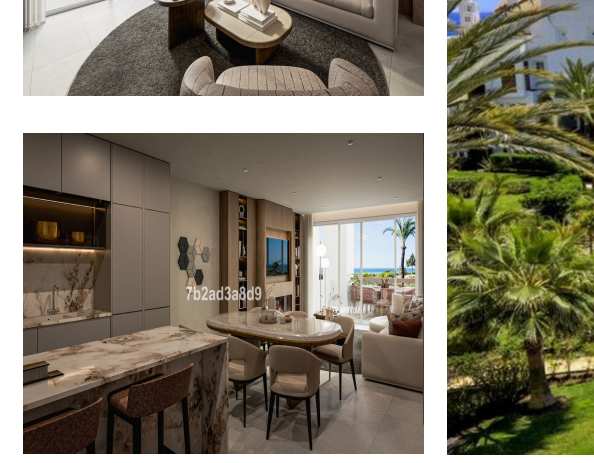
Community: 4,584 EUR / year