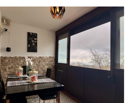
Ref.-ID: R4980310 Benalmadena