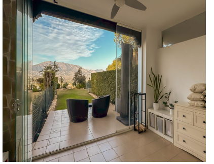
Community: 4,044 EUR / year