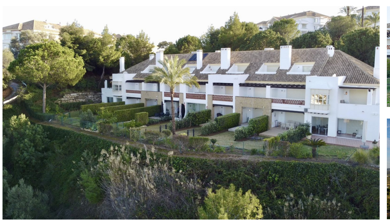
La Cala Golf

IBI: 883 EUR / year Rubbish: 128 EUR / year