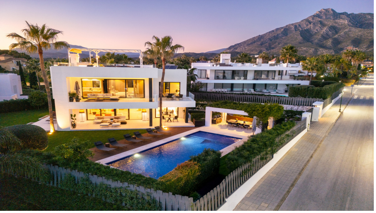
The Golden Mile