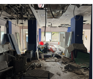
Ref.-ID: R4956460 Marbella Commercial