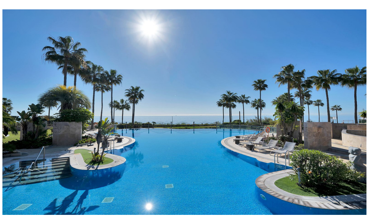
New Golden Mile