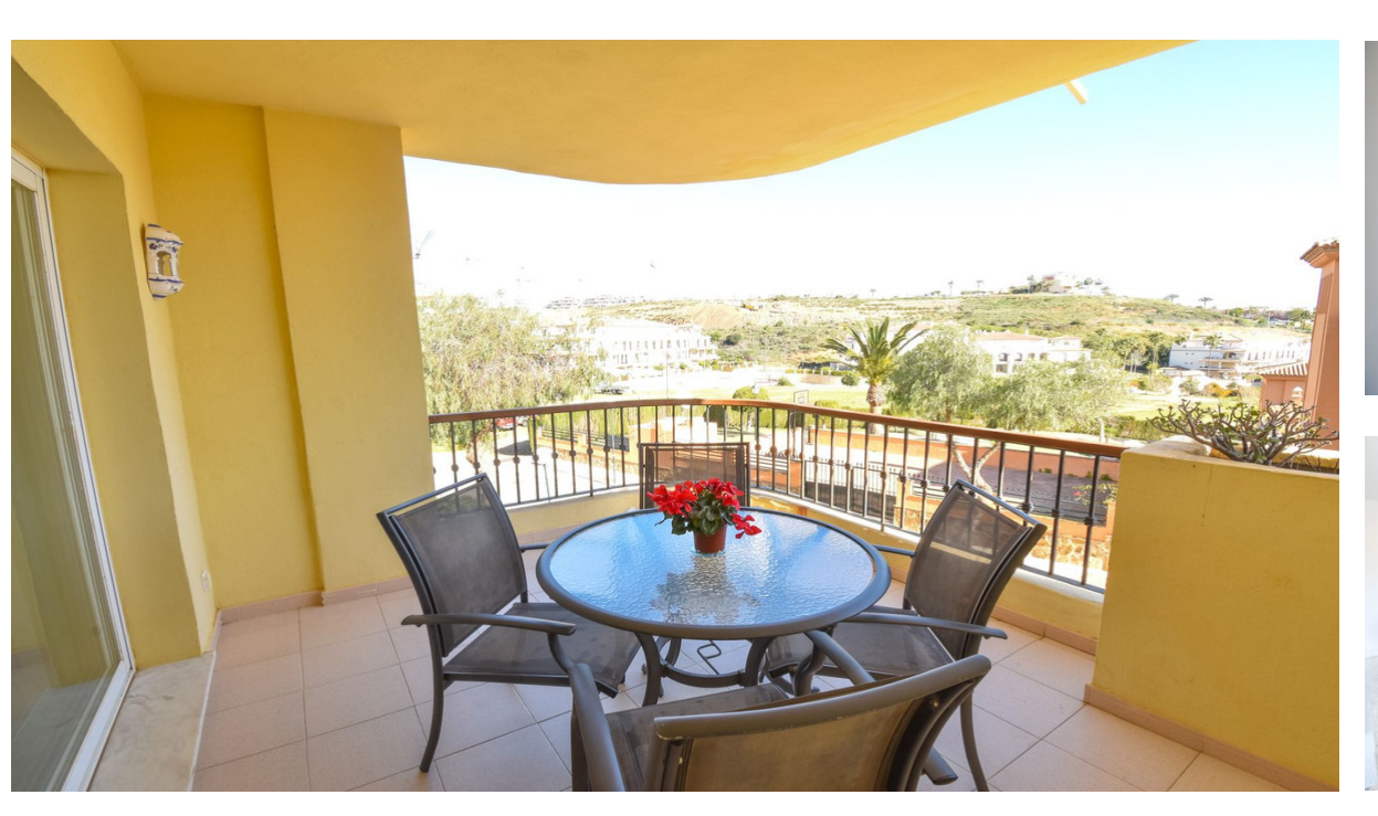
La Cala de Mijas