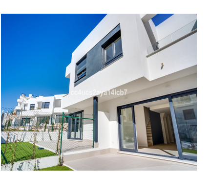
La Cala de Mijas House Ref.-ID: R4944208

Community: 2,280 EUR / year IBI: 850 EUR / year