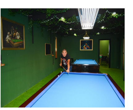
Ref.-ID: R4933525 Torremolinos Commercial