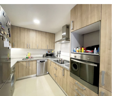
Ref.-ID: R4926721 Estepona House