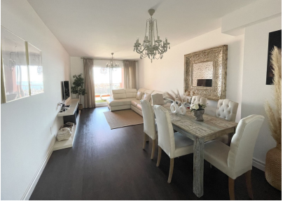
Community: 1,776 EUR / year