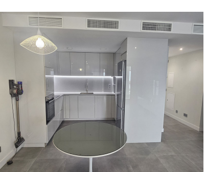
Ref.-ID: R4922602 Benalmadena Pueblo