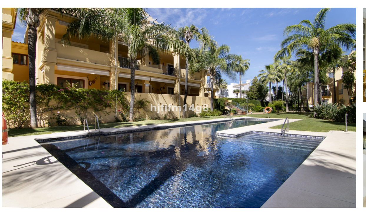
The Golden Mile