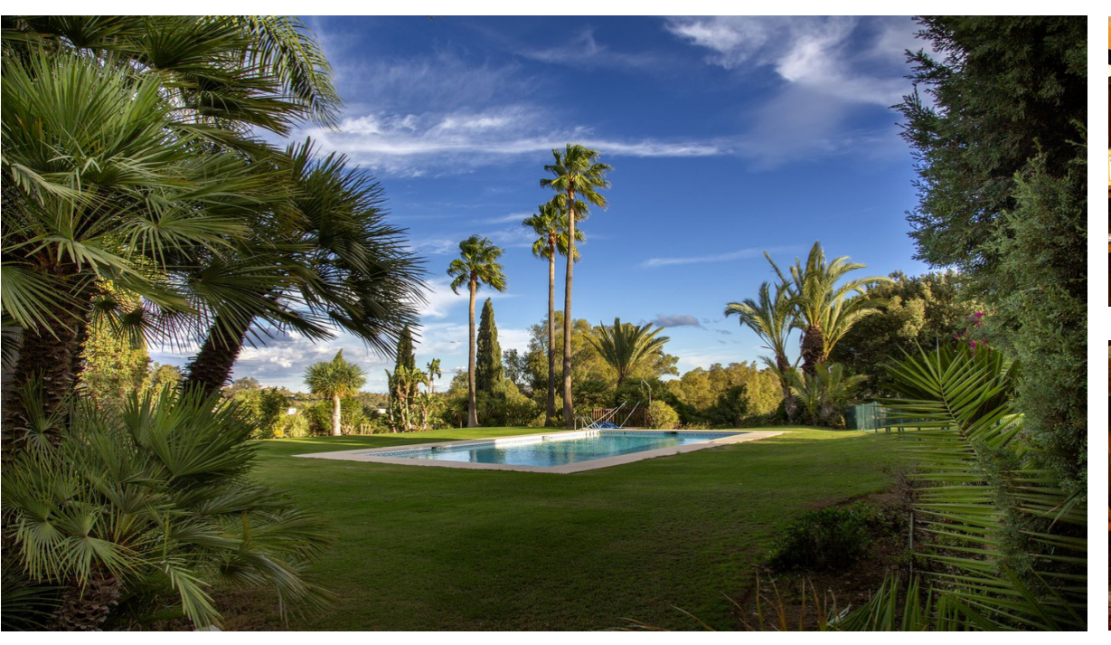
La Cala Golf