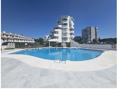
Community: 2,400 EUR / year