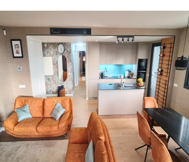
Ref.-ID: R4897504 Higueron