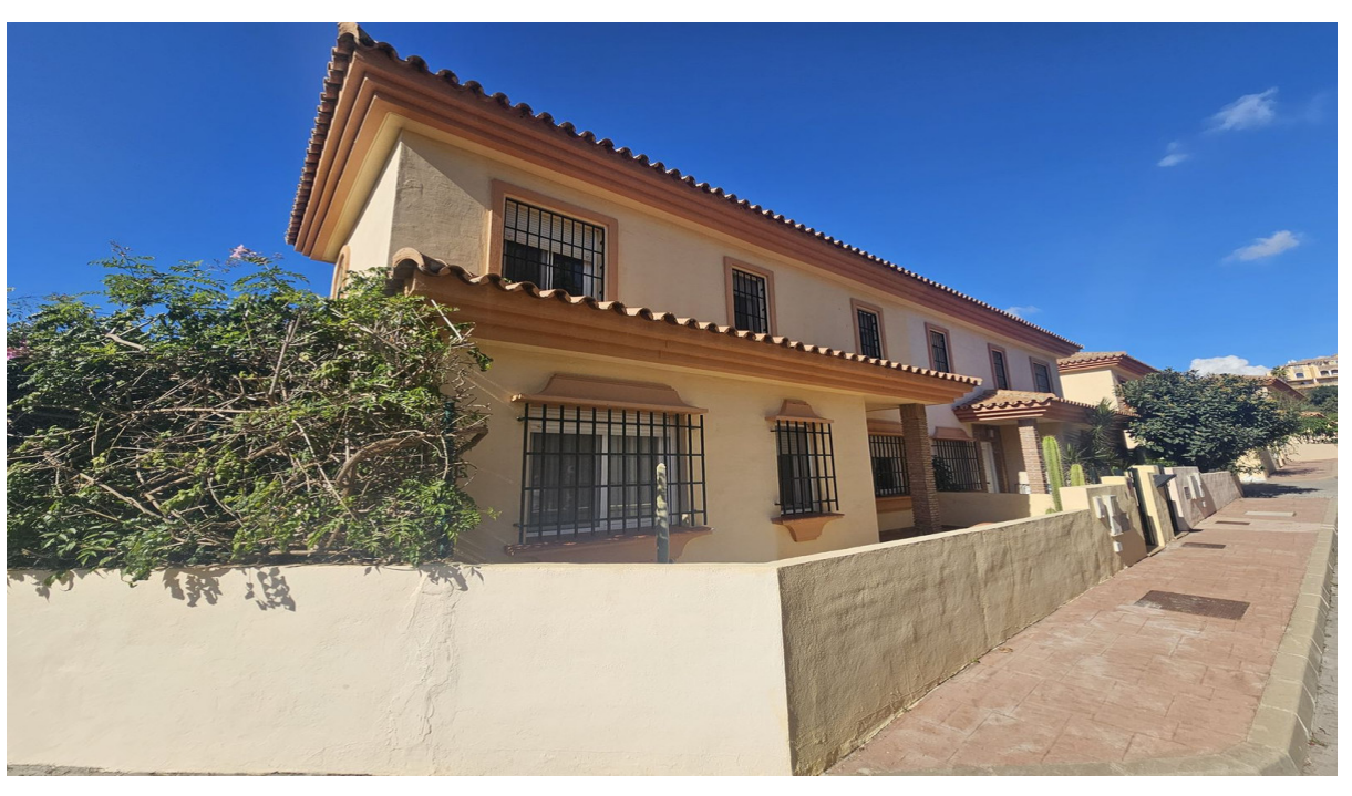
Riviera del Sol

IBI: 673 EUR / year Rubbish: 127 EUR / year