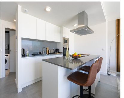
Community: 4,932 EUR / year