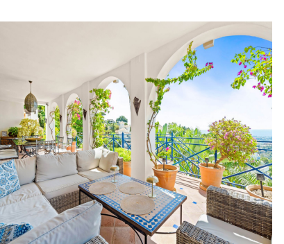
Ref.-ID: R4829236 Benahavís

Community: 3,816 EUR / year IBI: 2,178 EUR / year