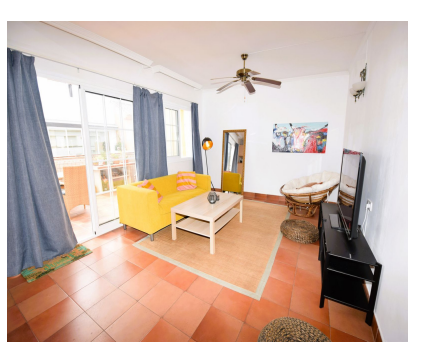
Ref.-ID: R4806697 La Cala de Mijas