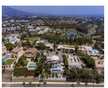
Ref.-ID: R4803826 Benahavís House

Community: 2,064 EUR / year IBI: 1,117 EUR / year