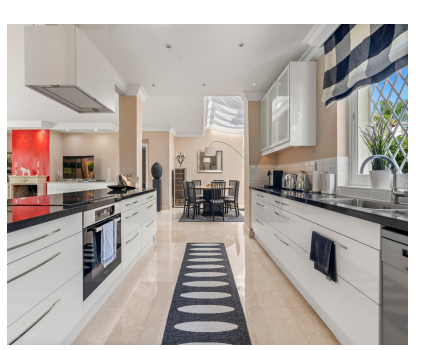
Ref.-ID: R4791718 The Golden Mile