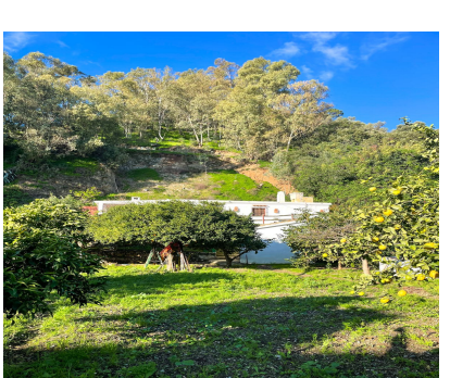
Ref.-ID: R4742626 Estepona