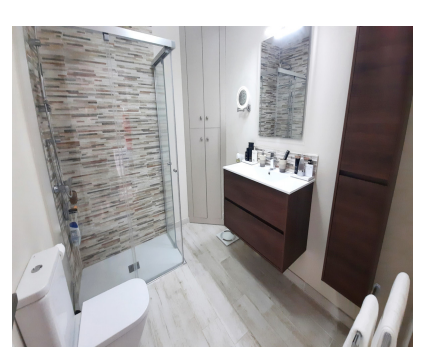
Ref.-ID: R4719547 Mijas Golf

Community: 804 EUR / year IBI: 170 EUR / year