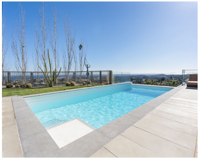
Community: 7,128 EUR / year