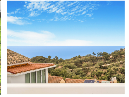
Ref.-ID: R4608739 La Mairena House

Community: 1,200 EUR / year IBI: 1,075 EUR / year