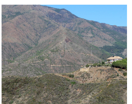
IBI: 3,508 EUR / year