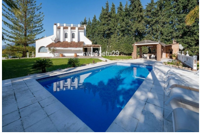
IBI: 432 EUR / year