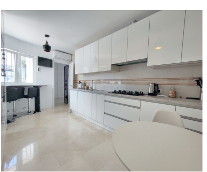
Ref.-ID: R4402273 Estepona House