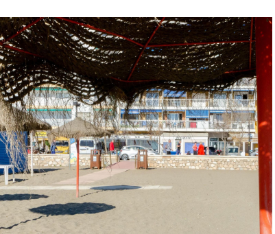
Ref.-ID: R4296190 Fuengirola Commercial