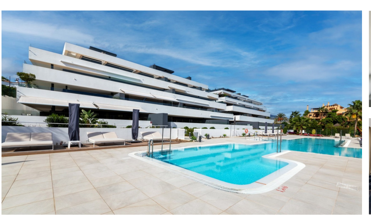
New Golden Mile