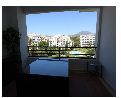
Ref.-ID: R4112719 Puerto Banús

Community: 2,892 EUR / year IBI: 1,231 EUR / year