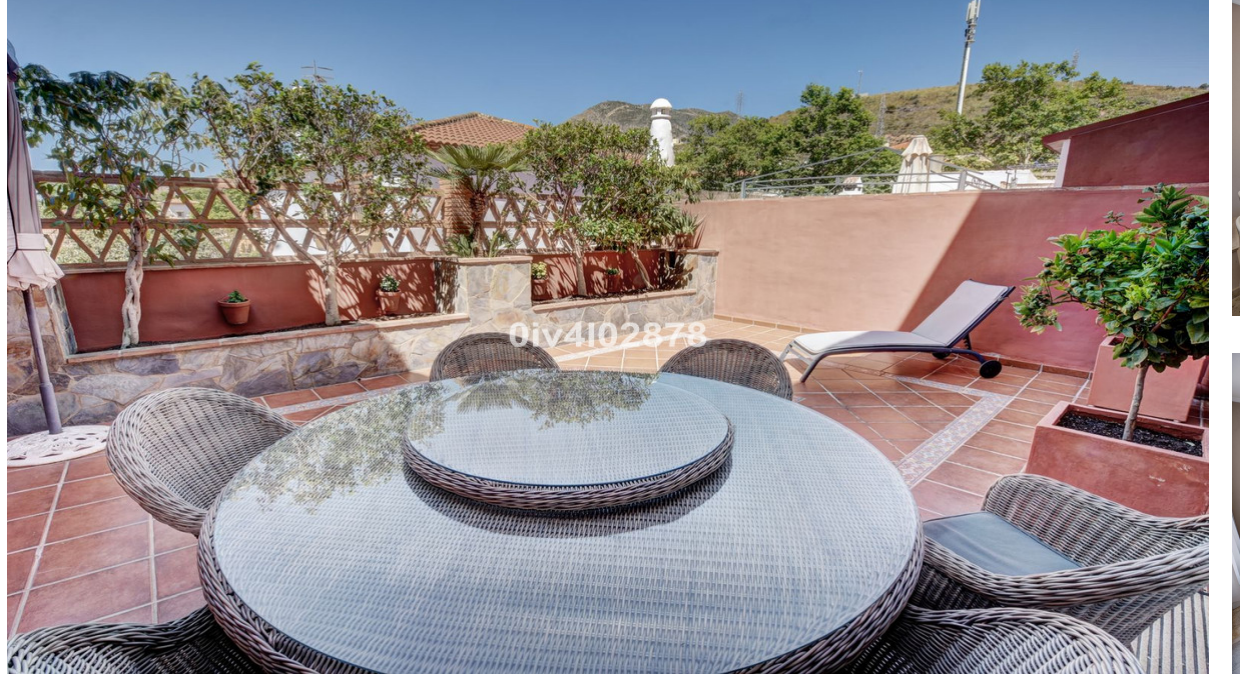
Arroyo de la Miel