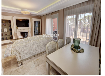
IBI: 880 EUR / year