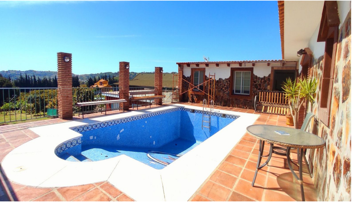
La Cala de Mijas