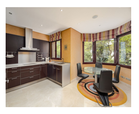
Puerto Banús Ref.-ID: R5065084 Apartment