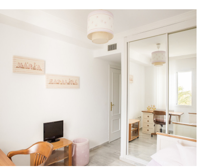
Ref.-ID: R5047240 Guadalmina Baja Apartment