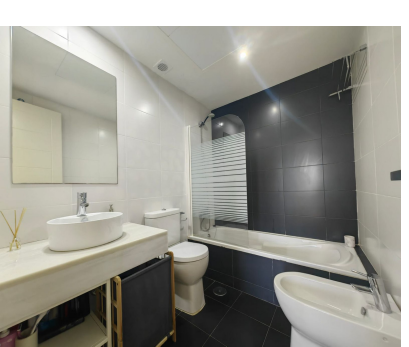
Ref.-ID: R5119057 Estepona