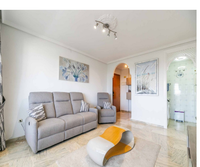
Ref.-ID: R5115427 Benalmadena Apartment