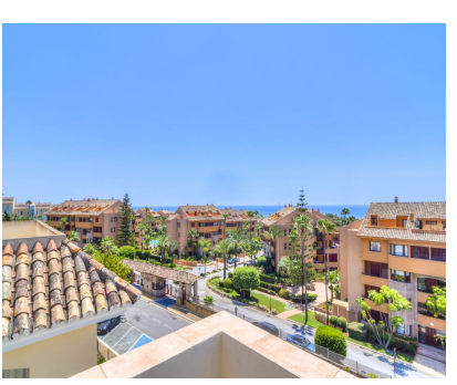
Community: 4,800 EUR / year