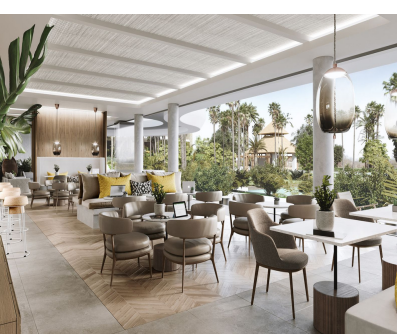
Estepona Apartment Ref.-ID: R5110600