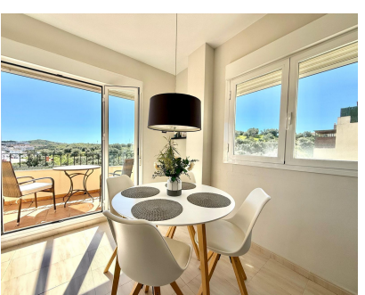
Ref.-ID: R5107453 Mijas Costa Apartment