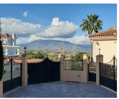
Ref.-ID: R5104969 Riviera del Sol House

Community: 1,068 EUR / year IBI: 1,358 EUR / year