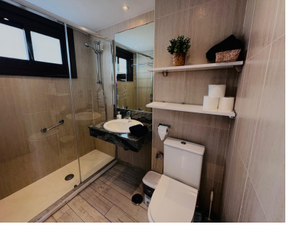
Apartment Ref.-ID: R5104309 Benalmadena