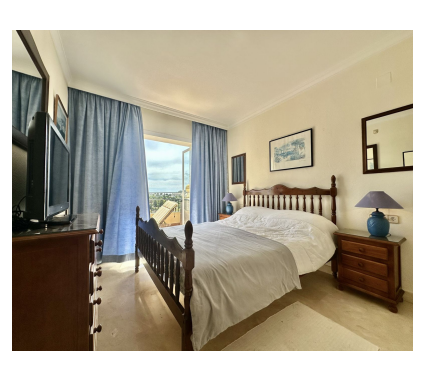
Ref.-ID: R5085538 Marbella Apartment