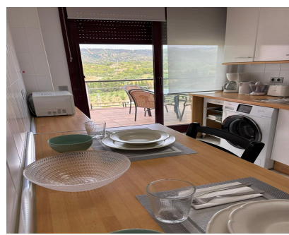
Ref.-ID: R5081719 Benahavís Apartment