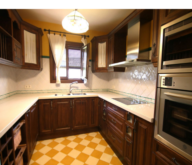
Ref.-ID: R5080792 Coín Apartment